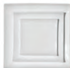
BCMX.02.19 19 cm / 7-1/2 in Qty: 6