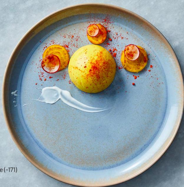
Cascade Blue (-171)

35CHF392 19 x 4 cm / 7-1/2 x 1-1/2" Qty: 12 20 oz Pair with 35CHF402